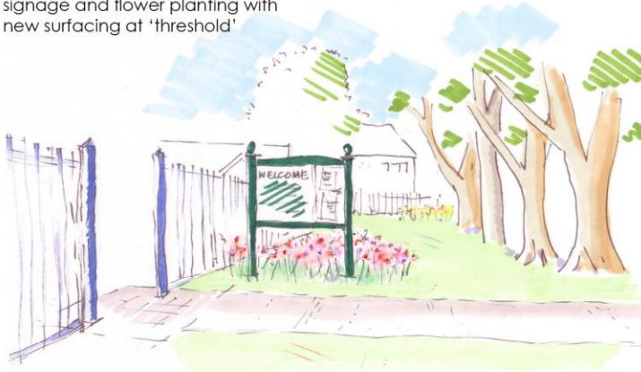
Connaught Hall Entrance

Remove barbed wire and replace perimeter fence and gates. New signage and flower planting with new surfacing at 'threshold'