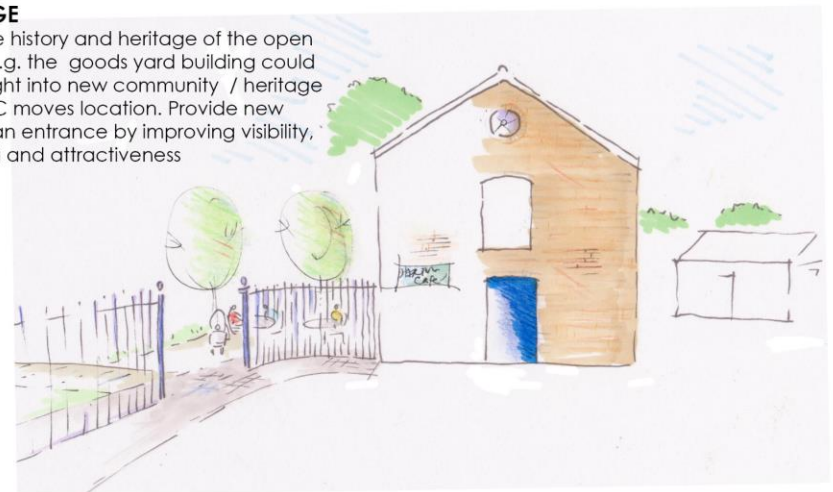
Station Entrance and Goods Yard Building

Share the history and heritage of the open space. e.g. the goods yard building could be brought into new community / heritage use if AFC moves location. Provide new pedestrian entrance by improving visibility, surfacing and attractiveness