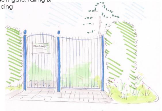
Thieves Lane Entrance

Remove hedging to open up visibility. New gate, railing & new surfacing