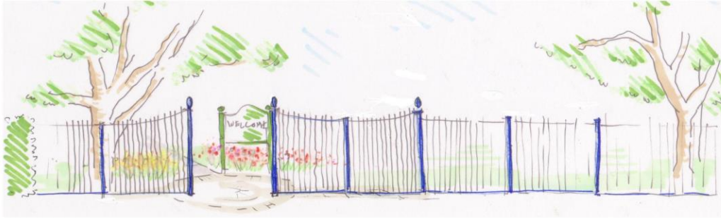
Main Town Centre Entrance

Retain existing gates with new railing to match. New signage and flower planting and new surfaced 'threshold' to make more welcome