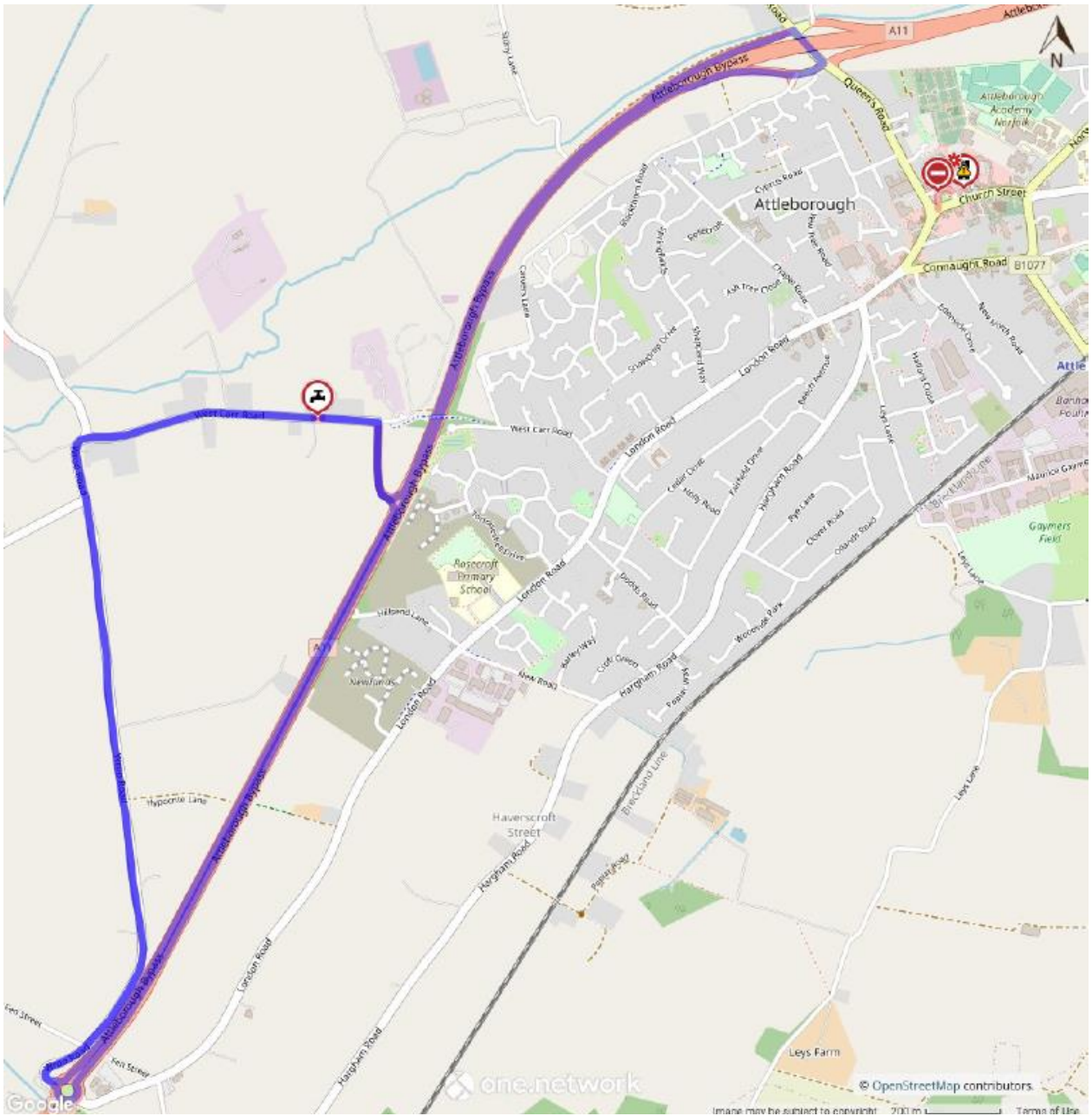
Attleborough STRO5181 HM