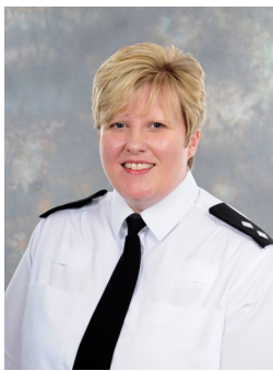
Local Policing Commander for Thetford and Attleborough