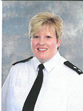
Local Policing Commander for Thetford and Attleborough