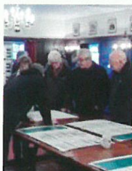
Interested Residents & Groups