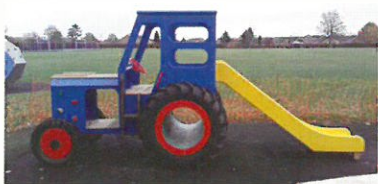
"Trusty the Tractor"

At the end of 2018, at a cost of £5,960, Attleborough Town Council arranged the purchase and installation of a new play tractor for children to use in the Recreation Ground play area. Following installation, a "Name the Tractor" competition was held in December 2018, giving children the opportunity to be directly involved in their new play equipment.